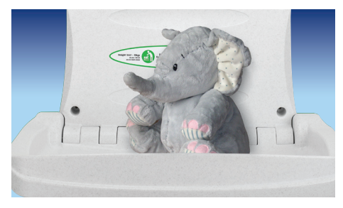
Superior integral strength, with stainless steel reinforced hinge, withstands static loads in excess of 100Kgs. Strong enough even for a baby elephant!