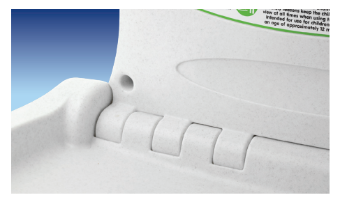
The unique hinge construction eliminates finger traps even during opening and closing. The hinge rotates within the enclosed moulding eliminating exposure to moving parts.